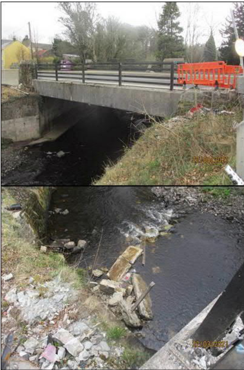
Plate 1 Works Area (left) and bridge debris in the river (right).

Lough Fern SPA (004060) is located ca. 3.5km d/s of bridge. The qualifying interests are: - Pochard ( Aythya ferina ) [A059] and Wetland and Waterbirds [A999]. The SPA is too remote from the proposed works area to be either directly or indirectly affected by the works.