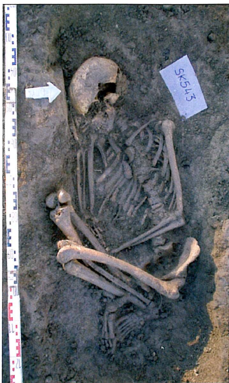
Left: Simple extended inhumation.