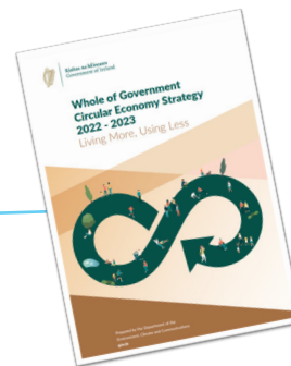
Whole of Government Circular Economy Strategy 2022-2023