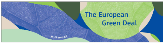
Green Deal - The EU Sustainability Strategy