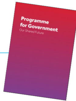
Programme for Government