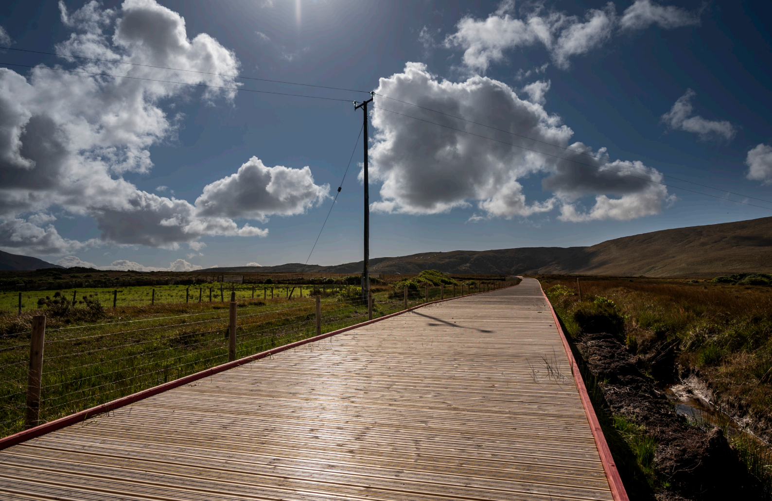
Achill Greenway