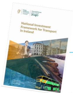
National Investment Framework for Transport in Ireland (NIFTI)