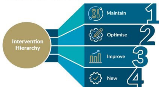
National Investment Framework for Transport in Ireland Intervention Hierarchy

The development of a Circular Economy Policy and Strategy by Transport Infrastructure Ireland (TII) aligns with the Whole of Government Circular Economy Strategy 2022 - 2023 and the objectives are aligned with those of the Department of Transport such as the National Investment Framework for Transport in Ireland (NIFTI).