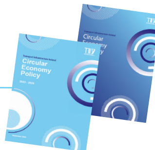
TII Circular Economy Policy & Strategy