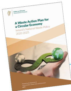
Waste Action Plan for a Circular Economy