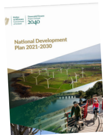
National Development Plan 2021-2030