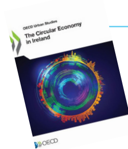
OECD Report The Circular Economy In Ireland