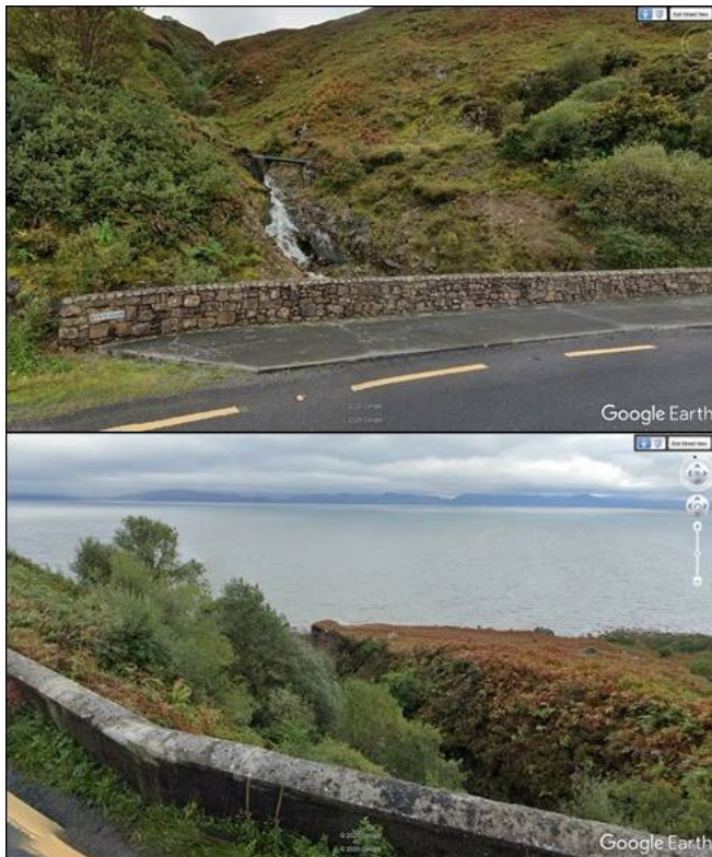
Plate 1: View looking south (left) and north to Dingle Bay (right).

Part of the roadside stone wall at the bridge has been damaged. The proposed works site is confined to the roadside stone wall adjoining the N70 (see attached photos). The proposed site is located on the south side of the carriageway. Photographs of the parapet damage are attached, while images taken from GoogleEarth are shown below (Plate 1) to illustrate the site context.