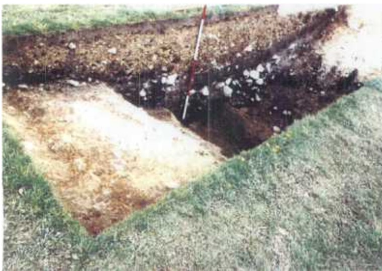
Left: South-facing section through cutting 1.