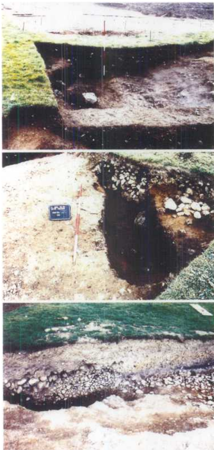
Top: Shot of ditch section showing modern drain/stone dump C49 to left of photo.