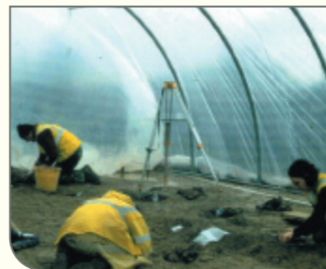
Archaeologists excavating features under a polytunnel at Cherryville .

In 1993 the Environmental Impact Statement (EIS) for the scheme recommended that a small number of high potential areas be tested for archaeological remains before construction. An aerial survey in 1996 identified seven areas of possible archaeological potential. The subsequent investigations at the Curragh and other areas revealed no archaeological features or sites.