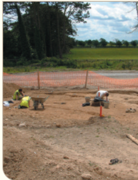
Archaeologists recording and excavating features at Frenchfurze .

The site at Frenchfurze covers an area about 70 m long and revealed a concentration of post-holes and two possible hearths. To the south-west of the main site three circular pits were excavated together with a linear pit. A stake-hole and a series of north-west–south-east agricultural plough furrows were also revealed in this area.