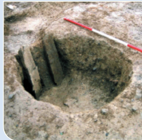
Pit uncovered at Cherryville after excavation.

arrowhead were found here. Radiocarbon dates suggest that this mound is contemporary with the Early Neolithic pottery which is typical of shouldered carinated bowls from this period, 3800 – 3500 BC. The mound contained layers of white marl, and there was no evidence for the usual pits, stake-holes or troughs so often associated with burnt mounds. There has been increasing evidence to suggest that burnt mounds, one of the most common site types discovered on road schemes, are not confined to the Bronze Age, but possibly have earlier beginnings. The site at Cherryville appears to confirm this.