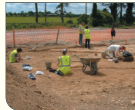
Excavations at the Bronze Age site uncovered at Frenchfurze .

The EIS had also recommended that the entire scheme be subject to archaeological monitoring during construction. The archaeological work was undertaken by Valerie J Keeley Ltd on behalf of the National Roads Authority and Kildare County Council .