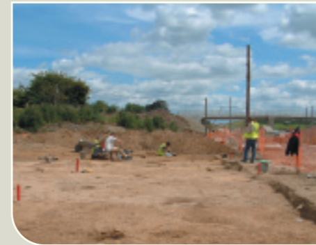
Archaeologists working at the Bronze Age site uncovered at Frenchfurze .

As the topsoil was stripped from the site prior to excavation, many finds were retrieved, namely: post-medieval and medieval pottery sherds, animal bone, clay pipe fragments, and a large amount of flints. A stone loom weight was also recovered. During the full excavation of the site some prehistoric pottery was also found.