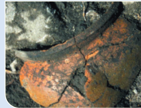
Medieval pot found during excavations at Cherryville prior to its removal.

The large amount of medieval pottery and the pair of tweezers, which may date from the 12th century, suggest the other features on the site are also medieval, and post-excavation analysis will confirm if the bowl furnaces, ditches and pits are contemporary.