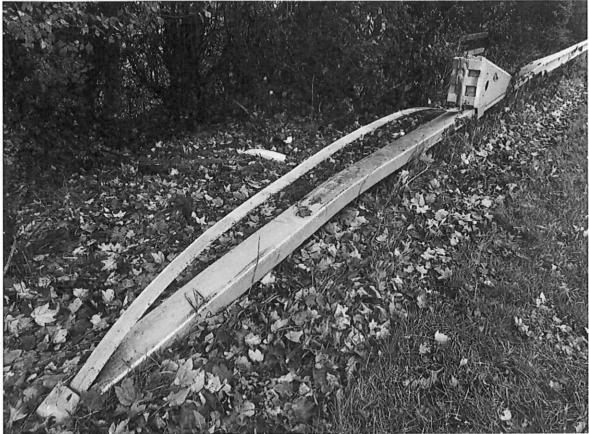
Plate 2. Damaged P4 end terminal