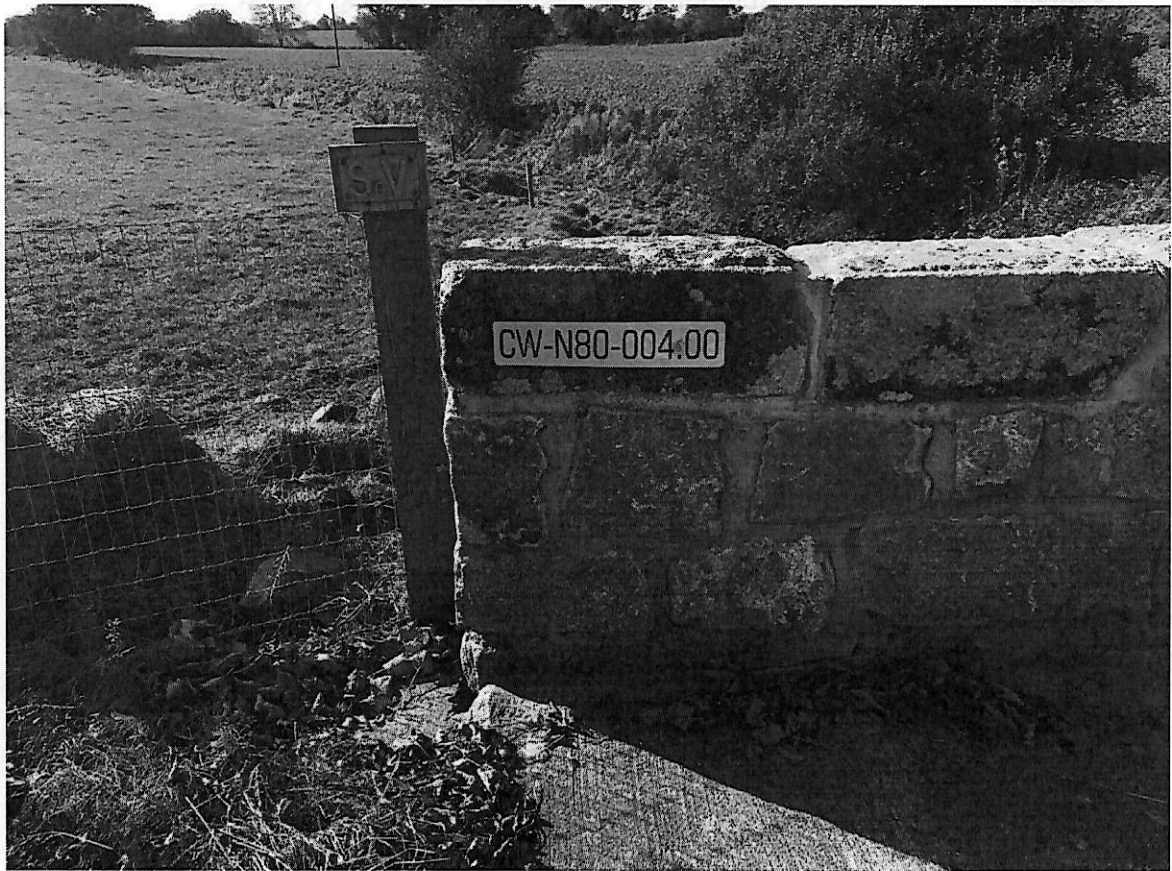
Plate 1. Boggan Bridge