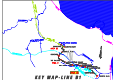
KEY MAP-LINE B1