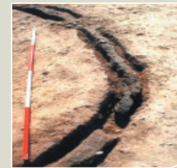
View of plank walling from an Iron Age structure uncovered during excavations at Ballinaspig More .

Excavations at Ballinaspig More also revealed an Iron Age structure comprising of a sub-circular arrangement of post-holes, which had been severely damaged by erosion. These features have been interpreted as the remains of a probable roundhouse. Radiocarbon analysis has returned a date of 360-280 BC.