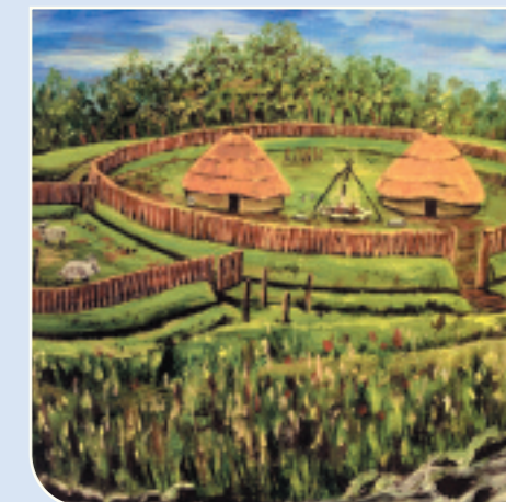
Reconstruction drawing of what the enclosure site uncovered at Curraheen may have looked like. (Figure A.C.S. Ltd.)

Additional sites at Curraheen included the badly damaged remains of two conjoined enclosures of early medieval date. Both enclosures were defined by shallow ditches and, originally, were likely to have had internal earthen banks. The larger of the two contained a range of settlement features including a probable house foundation as well as numerous pits, hearths, post-holes and stake-holes. Finds included iron objects, a glass bead, a fragment of a copper-alloy stick pin, hazelnut shells and charred seeds. Internally, the smaller enclosure contained only a few isolated post-holes and has been interpreted as a livestock pen. The main phase of activity on the site has been radiocarbon dated to AD 595-830.