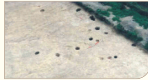
Aerial view of an Iron Age structure uncovered during excavations at Ballinaspig More .