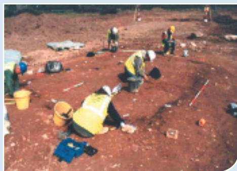
Archaeologists working on the excavation of a Neolithic house at Barnagore .

Site investigations at Barnagore revealed a rectangular house foundation, surviving as slot-trenches with in situ remains of burnt timber planking and stakes. The slot trench varied from 0.22-0.50m in width and was 0.12m-0.20m in depth. The planking was identified as oak and has provided radiocarbon dates ranging from