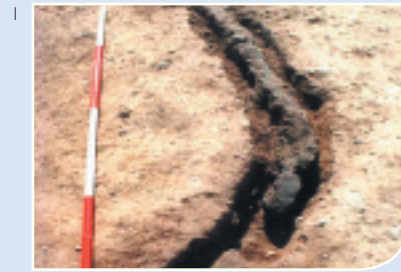
1. Iron Age structure View of plank walling from an Iron Age structure uncovered during excavations at Ballinaspig More .

Some of the findings in and around Ballincollig .