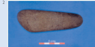
2. Stone axe Stone axe found during excavations at Barnagore .