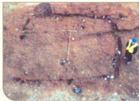
Early Neolithic house uncovered during excavations at Barnagore .

A significant example was uncovered at Ballinaspig More . Here two distinct fulachta fiadh were revealed, one built after the earlier had been long abandoned. The earlier fulacht fiadh contained a sub-oval trough, measuring 1.75m x 1.15m and 0.73m deep, in association with a dense cluster of stake-holes. This activity produced a Late Neolithic radiocarbon date of 2800-2500 BC. The second fulacht fiadh had a sub-rectangular trough, measuring 1.9m x 0.88m and 0.3 m deep. A series of stake-holes were also present to the east and west. This latter activity produced a Middle/Late Bronze date range of 1430-1130 BC.