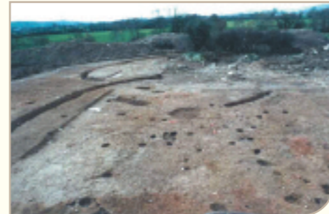
View of the early medieval enclosure uncovered during excavations at Curraheen .

The N22 Ballincollig Bypass is 11.5km in length and stretches across six townlands. Archaeological site investigations in advance of construction identified a variety of site types, ranging from Neolithic settlement structures to Bronze Age houses, cremation pits and fulachta fiadh , to Iron Age pits, medieval farm enclosures and post-medieval industrial sites. The work was carried out by Archaeological Consultancy Services Ltd. , (A.C.S. Ltd.) on behalf of the National Roads Authority and Cork County Council .