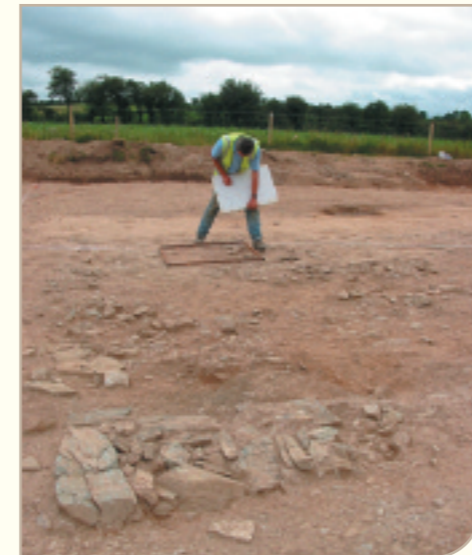
Archaeologist carrying out detailed recording on the excavations at Ballinaspig More .

The N22 Ballincollig Bypass is 11.5km in length and stretches across six townlands. Archaeological site investigations in advance of construction identified a variety of site types, ranging from Neolithic settlement structures to Bronze Age houses, cremation pits and fulachta fiadh , to Iron Age pits, medieval farm enclosures and post-medieval industrial sites. The work was carried out by Archaeological Consultancy Services Ltd. , (A.C.S. Ltd.) on behalf of the National Roads Authority and Cork County Council .