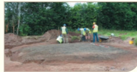
Burnt spread from a fulacht fiadh excavated at Ballinaspig More .