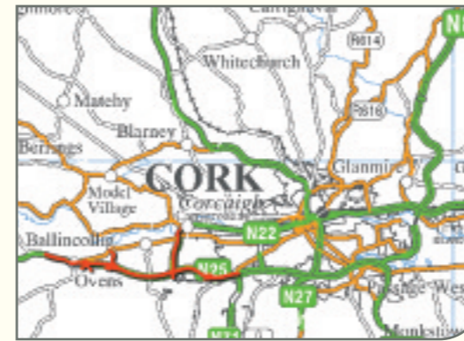
© Ordnance Survey Ireland & Government of Ireland permit number 8067.