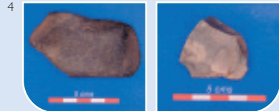
5. Flint Flint find recovered from excavations at Ballinaspig More .