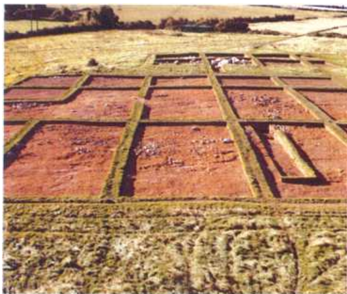
View of enclosure under excavation, from east

L arge-scale excavations have been taking place on a prehistoric monument complex nestling in the foothills of the Dublin Mountains. The work is being carried out by Valerie J. Keeley Ltd for Dun Laoghaire–Rathdown County Council and the National Roads Authority as part of the South-Eastern Motorway Project.