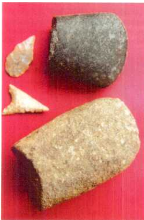
Collection of mixed prehistoric tools from excavations at Laughanstown/Glebe

The wedge tomb lies 10m north of the edge of the road route. A large oval enclosure with a hollow centre was suggested by the topographical survey. The monument is up to 30m in diameter. On removal of the sod and ploughsoil this was found to be defined by a low earthen bank, c. 8–10m wide, which was cast up from a central hollow some 10m wide. The earthen bank was subsequently capped with a ring of stones, mostly granite, of varying sizes. This survives best on the eastern side. There is no ditch. The entire monument, which had been constructed on a high point within the field, has been gradually reduced by ploughing. A number of pits containing large stones located on the path of furrows suggest the farmers' frustration with continually hitting obstacles. A fragment of a saddle quern formed part of the stone bank, along with a considerable number of hammerstones and a porphyry axe, the latter missing its butt end. The banks contain a number of features within their matrix which are currently being excavated. Some contain burnt bone fragments, charcoal and decorated and plain pottery fragments, while others contain only the latter. A stone spindle-whorl was recovered from a pit in the interior. Scatters of burnt human bone were found on the banks.