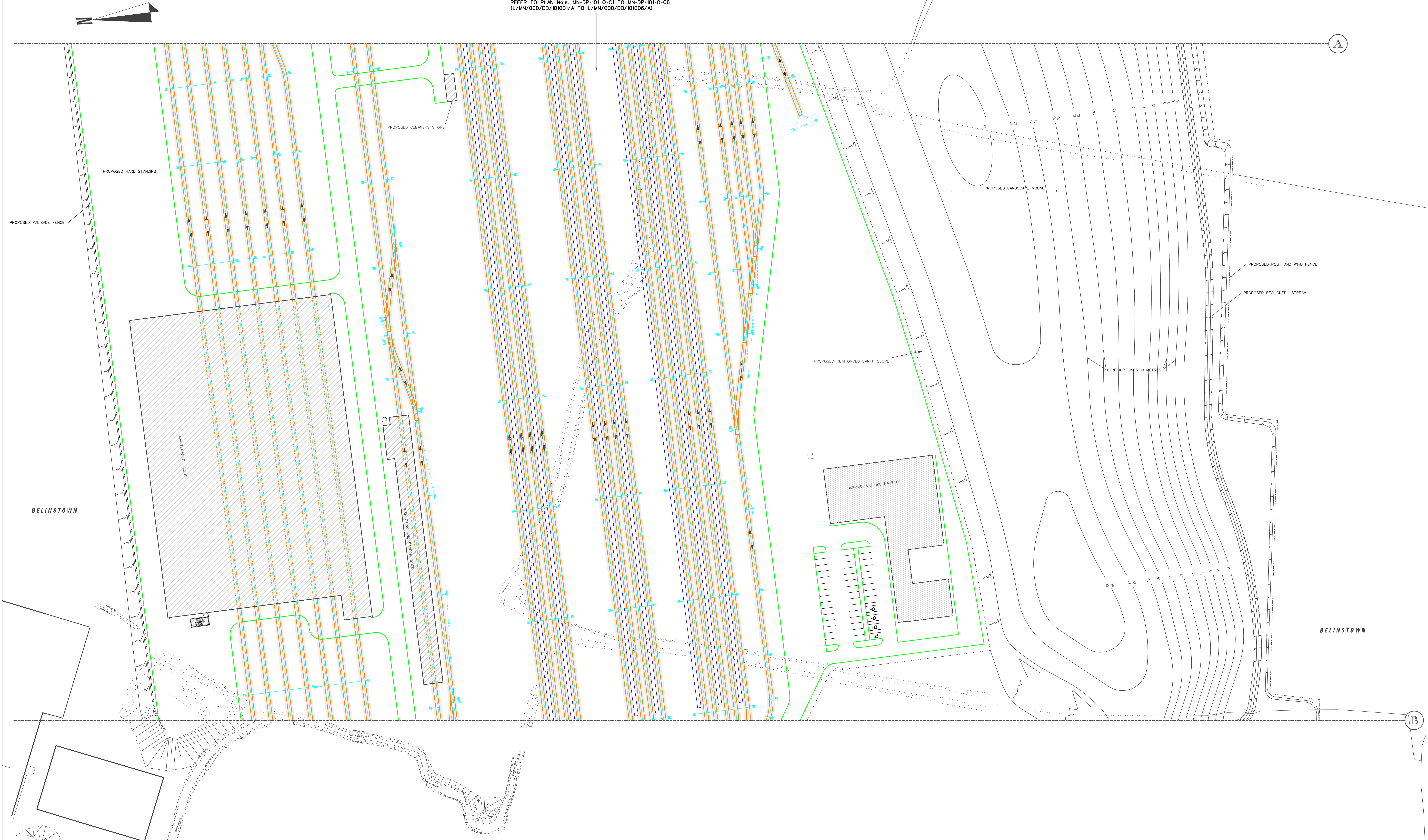
PLAN SCALE 1:500

FOR DETAILS OF PROPOSED BELINSTOWN DEPOT REFER TO PLAN No's. MN-DP-101 0-C1 TO MN-DP-101 0-C6 (L/MN/000/DB/101001/A TO L/MN/000/DB/101006/A)