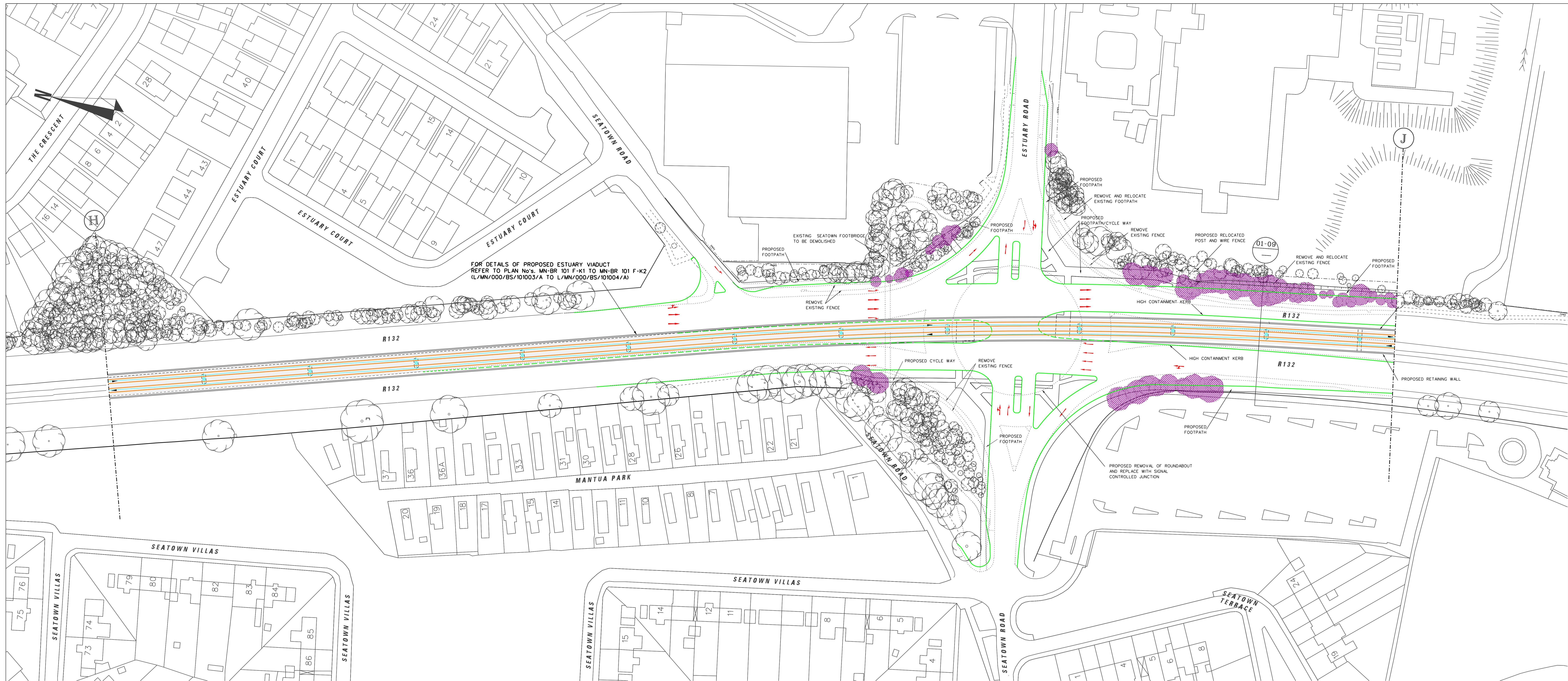
PLAN SCALE 1:500